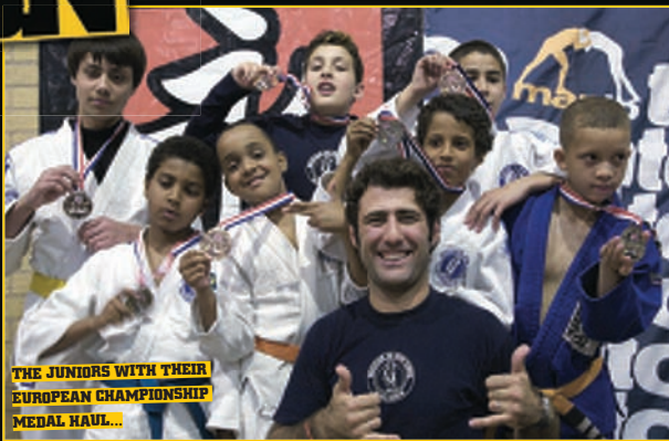
THE JUNIORS WITH THEIR EUROPEAN CHAMPIONSHIP MEDAL HAUL...

The young grapplers, who range from four to sixteen, travel from all over London and