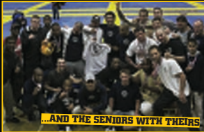
...AND THE SENIORS WITH THEIRS